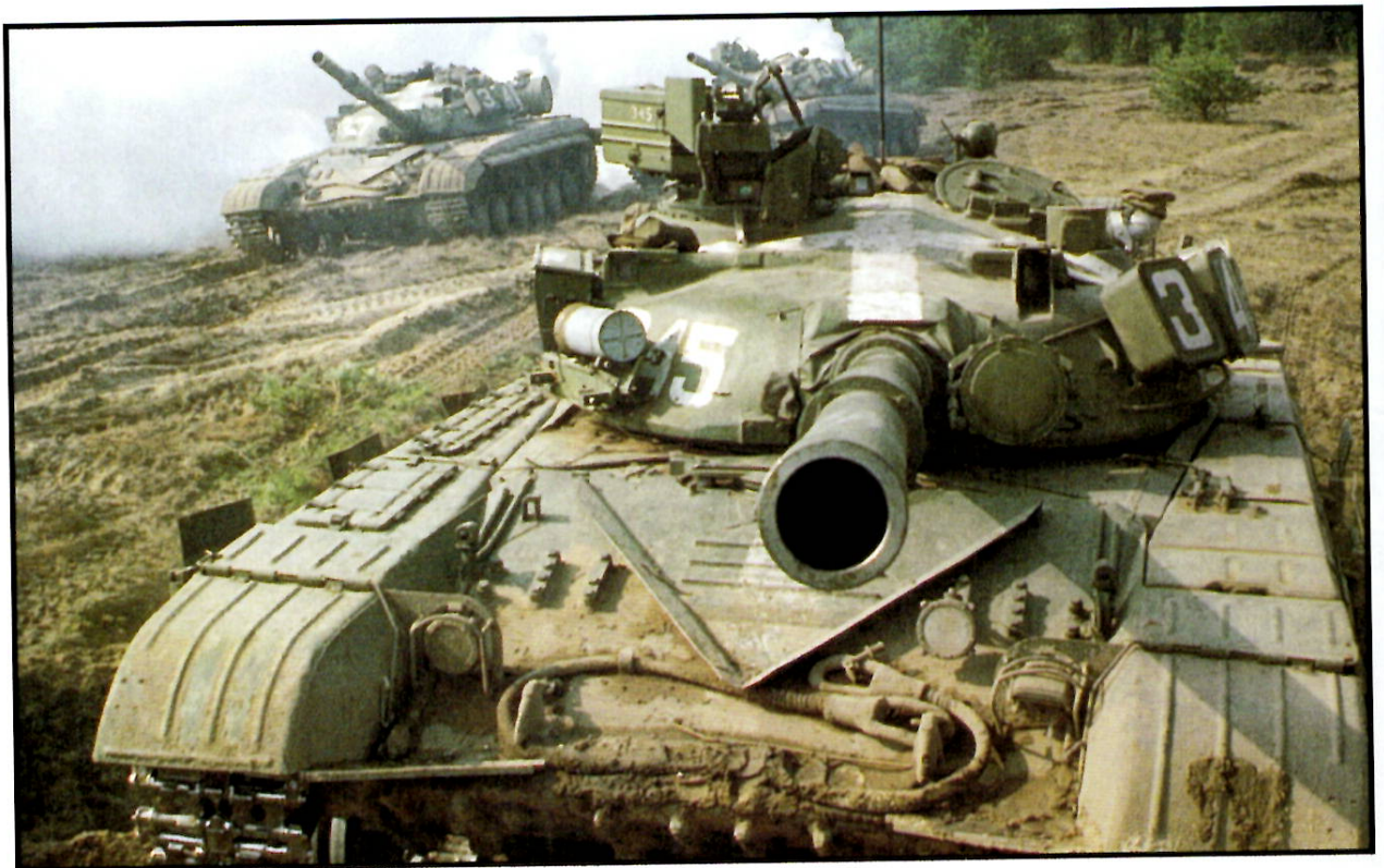
Above: A Soviet T64K on exercise.

By Devils with Wings and Cold War Turned Hot author Harvey Black.